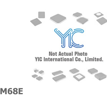
SIM68E SIMCOM SIM68E SIMCOM