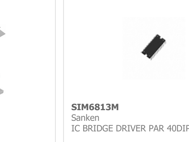
IC BRIDGE DRIVER PAR 40DIP