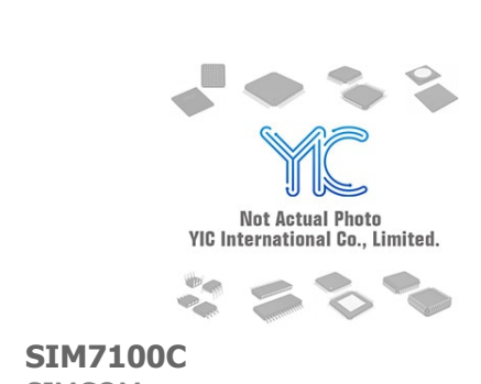
SIMCOM SIMCOM LCC