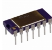
AD637JDZ ADI (Analog Devices, Inc.) IC RMS/DC CONV PRECISION 14-CDIP