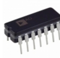
AD637JQ ADI (Analog Devices, Inc.) IC RMS/DC CONV PRECISION 14-CDIP