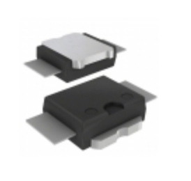
PD57018S STMicroelectronics FET RF 65V 945MHZ PWRSO-10