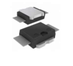
PD57030S STMicroelectronics FET RF 65V 945MHZ PWRSO-10