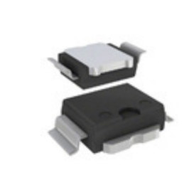
PD57030-E STMicroelectronics FET RF 65V 945MHZ PWRSO10