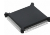
MC68332ACFC20B1 NXP USA Inc. IC MCU 32BIT ROMLESS 132QFP