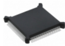
MC68332ACEH20 NXP USA Inc. IC MCU 32BIT ROMLESS 132QFP