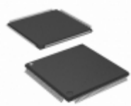
MC68332ACAG20 NXP USA Inc. IC MCU 32BIT ROMLESS 144LQFP