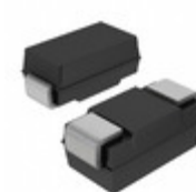
RB058L-40DDTE25 Rohm Semiconductor DIODE SCHOTTKY 40V 3A PMDS