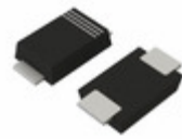
RB056LAM-40TFTR LAPIS Semiconductor AUTOMOTIVE SCHOTTKY BARRIER DIOD