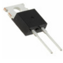
DSEP8-02A IXYS DIODE GEN PURP 200V 8A TO220AC