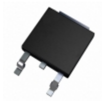
DSEP8-03AS IXYS DIODE GEN PURP 300V 8A TO252AA