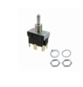
ET225P-Z Copal Electronics Inc. SWITCH TOGGLE DPDT 25A 125V