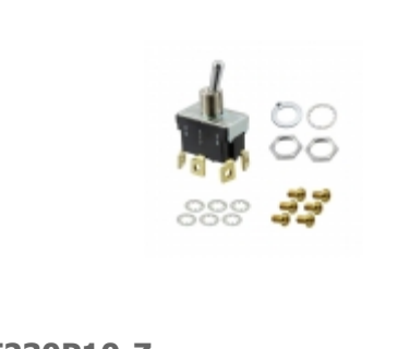
ET230P10-Z Copal Electronics Inc. SWITCH TOGGLE DPDT 30A 125V