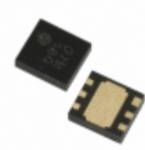
XC6122D420ER-G Torex Semiconductor Ltd. IC WATCHDOG TIMER 6-USP