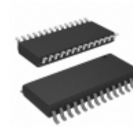
PIC16C72T-04E/SO Micrel / Microchip Technology IC MCU 8BIT 3.5KB OTP 28SOIC