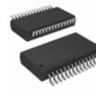
PIC16C72AT-20I/SS Micrel / Microchip Technology IC MCU 8BIT 3.5KB OTP 28SSOP