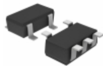
BU4819G-TR LAPIS Semiconductor IC VOLT DETECTOR 1.9V SSSOP