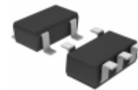
BU4820G-TR LAPIS Semiconductor IC VOLT DETECTOR 2.0V SSOP5