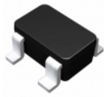
BU4820F-TR LAPIS Semiconductor IC VOLT DETECTOR 2.0V SOP4