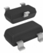
BCX71K,215 Nexperia USA Inc. TRANS PNP 45V 0.1A SOT23