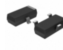
BCX71K Fairchild/ON Semiconductor TRANS PNP 45V 0.5A SOT-23