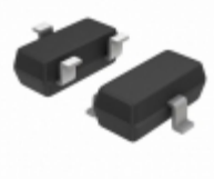
BCX71JLT1G ON Semiconductor TRANS PNP 45V 0.1A SOT-23