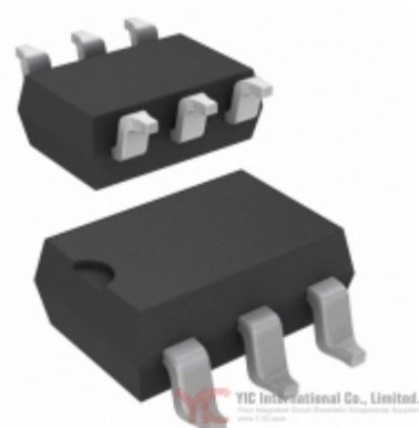
Image may be representation. See specs for product details.