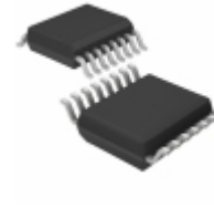
ADM691AARU-REEL ADI (Analog Devices, Inc.) IC SUPERVISOR MPU 4.65V 16TSSOP