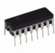
ADM691AQ ADI (Analog Devices, Inc.) IC SUPERVISOR MPU 4.65V 16CDIP