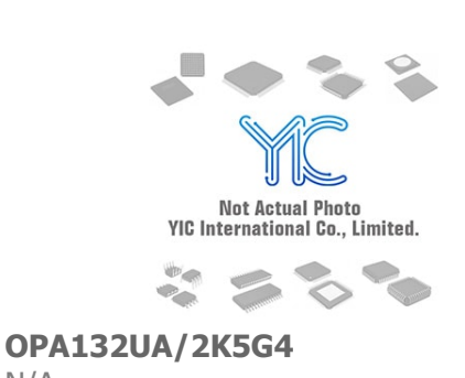
IC OPAMP GP 8MHZ 8SOIC