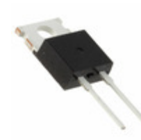
DSI30-16A IXYS DIODE GEN PURP 1.6KV 30A TO220AC