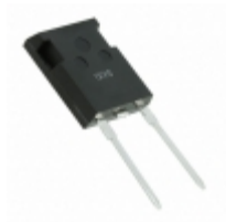
DSEP30-06BR IXYS DIODE GEN 600V 30A ISOPLUS247