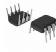
DS1013M-35 Maxim Integrated IC DELAY LINE 35NS 8DIP