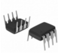
DS1013M-75 Maxim Integrated IC DELAY LINE 75NS 8DIP