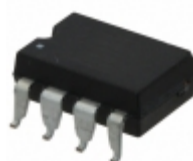
LBB120STR IXYS Integrated Circuits Division RELAY OPTOMOS 170MA DP-NC 8-SMD