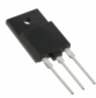
DSEP30-03AS IXYS DIODE GEN PURP 300V 30A TO247AD