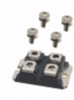
DSEP2X61-06A IXYS DIODE MODULE 600V 60A SOT227B