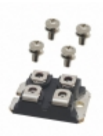
DSEP2X91-03A IXYS DIODE MODULE 300V 90A SOT227B