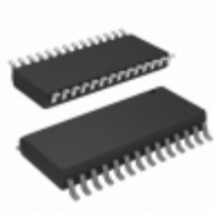
PIC16C72AT-20I/SO Micrel / Microchip Technology IC MCU 8BIT 3.5KB OTP 28SOIC