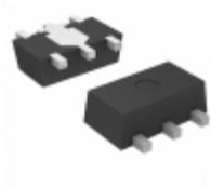
S-818A34AUC-BGOT2G SII Semiconductor Corporation IC REG LDO 3.4V 0.2A SOT89-5