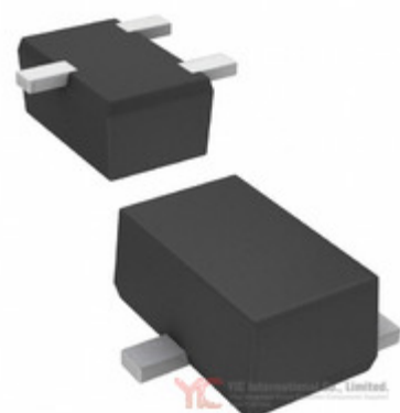
Image may be representation. See specs for product details.