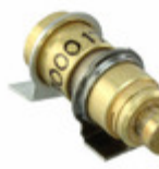
V9000 Knowles Voltronics CAP TRIMMER 1-12PF 2000V SMD