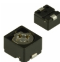
TZB4R500AB10R00 Murata Electronics North America CAP TRIMMER 7-50PF 50V SMD