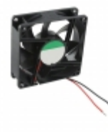
EB50101S2-000U-999 Sunon FAN AXIAL 50X10MM 12VDC WIRE