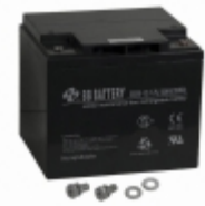
EB50-12-I2 B B Battery BATTERY LEAD ACID 12V 50AH