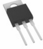
UGE18DCT-E3/45 Electro-Films (EFI) / Vishay DIODE 18A 150V 20NS TO-220AB