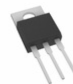
UGE18CCT-E3/45 Electro-Films (EFI) / Vishay DIODE 18A 150V 20NS TO-220AB