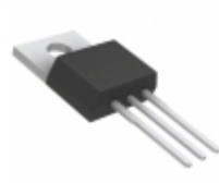
UGE10DCT-E3/45 Vishay Semiconductor Diodes Division DIODE 10A 200V 20NS TO-220AB