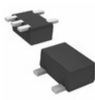
DMC561070R Panasonic Electronic Components TRANS 2NPN PREBIAS 0.15W SMINI5