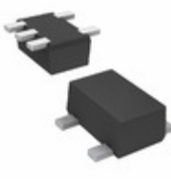
DMC562000R Panasonic Electronic Components TRANS 2NPN PREBIAS 0.15W SMINI5