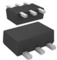
DMC564020R Panasonic Electronic Components TRANS 2NPN PREBIAS 0.15W SMINI6