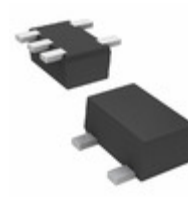
DMC5610E0R Panasonic Electronic Components TRANS 2NPN PREBIAS 0.15W SMINI5