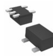
DMC561060R Panasonic Electronic Components TRANS 2NPN PREBIAS 0.15W SMINI5