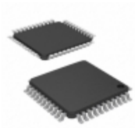
PIC18F4221T-I/PT Micrel / Microchip Technology IC MCU 8BIT 4KB FLASH 44TQFP