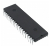
PIC18F4221-I/P Micrel / Microchip Technology IC MCU 8BIT 4KB FLASH 40DIP