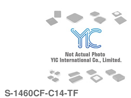
SEIKO SEIKO SOP24