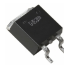
BTA312B-600E,118 WeEn Semiconductors TRIAC SENS GATE 600V 12A D2PAK