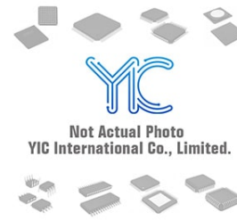
BTA312X-600B NXP BTA312X-600B NXP