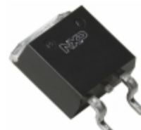
BTA312B-800ET,118 WeEn Semiconductors TRIAC SENS GATE 800V 12A D2PAK