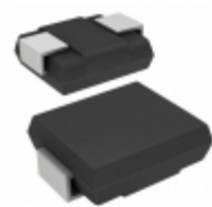
ERZ-CF2MK271 Panasonic Electronic Components VARISTOR 270V 200A 2SMD JLEAD