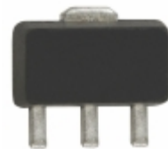
SGA-5489Z RFMD IC AMP HBT SIGE 4000MHZ SOT-89