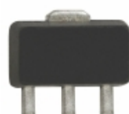
SGA-5389Z RFMD IC AMP HBT SIGE 4500MHZ SOT-89