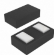
DS2502X1+UW Maxim Integrated IC OTP 1KBIT 1WIRE 4WLP