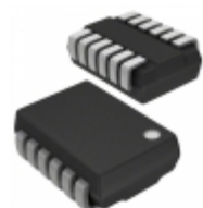
RX-4803LC:UA PURE SN Epson REAL TIME CLOCK SER 12-PIN VSOJ