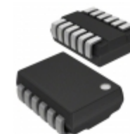
RX-4803LC:UB3 PURE SN Epson IC TRC CLK/CALENDAR