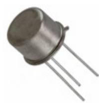
JANTX2N4150S Microsemi Corporation TRANS NPN 70V 10A TO-39