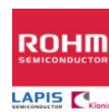
MTZJT-7233B/33V ROHM MTZJT-7233B/33V ROHM