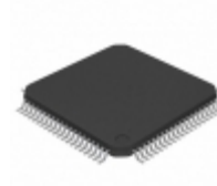
MKE06Z64VLK4 NXP USA Inc. IC MCU 32BIT 64KB FLASH 80LQFP