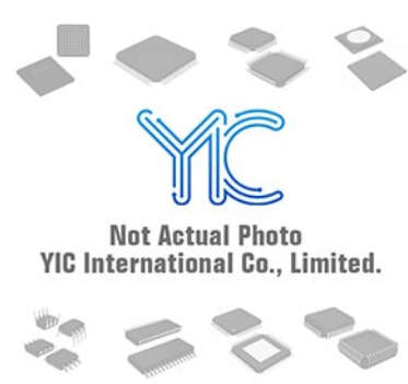
Image may be representation. See specs for product details.