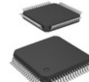
MKE06Z64VLH4 NXP USA Inc. IC MCU 32BIT 64KB FLASH 64LQFP