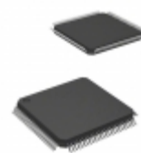
MKE14F512VLL16 NXP USA Inc. IC MCU 32BIT 512KB FLASH 100LQFP