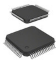
MKE14F256VLH16 NXP Semiconductors / Freescale KINETIS KE14F: 160MHZ CORTEX-M4F