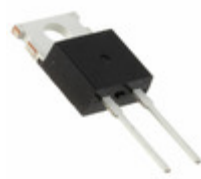
DNA30E2200PA IXYS DIODE GEN PURP 2.2KV 30A TO220AC