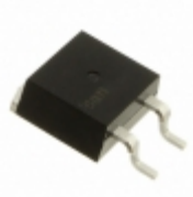
DNA30E2200PZ IXYS DIODE RECT 2200V 30A D2PAK- HV