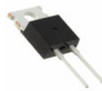
DNA30E2200PA IXYS DIODE GEN PURP 2.2KV 30A TO220AC