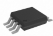
ADR3525WBRMZ-R7 Analog Devices Inc. IC VREF SERIES 2.5V 8MSOP