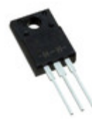
MBRF25150CTHCOG TSC (Taiwan Semiconductor) DIODE ARRAY SCHOTT 150V ITO220AB