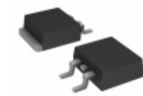
VS-16CTQ080SHM3 Electro-Films (EFI) / Vishay DIODE SCHOTTKY 80V 8A D2PAK