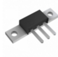
85CNQ015 SMC Diode Solutions DIODE SCHOTTKY 15V 40A PRM2