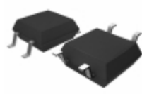
BU4826F-TR LAPIS Semiconductor IC VOLT DETECTOR 2.6V SOP4