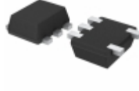
BU4827FVE-TR LAPIS Semiconductor IC VOLT DETECTOR 2.7V VSOF5