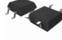
BU4828F-TR LAPIS Semiconductor IC VOLT DETECTOR 2.8V SOP4