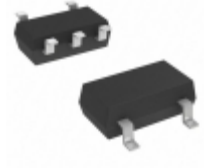
XN0221100L Panasonic Electronic Components TRANS 2NPN PREBIAS 0.3W MINI5