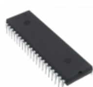
PIC18F4680-H/P Micrel / Microchip Technology IC MCU 8BIT 64KB FLASH 40DIP