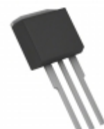
IRF3707ZLPBF International Rectifier (Infineon Technologies) MOSFET N-CH 30V 59A TO-262