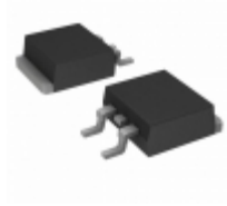
IRF3707ZSTRLPBF International Rectifier (Infineon Technologies) MOSFET N-CH 30V 59A