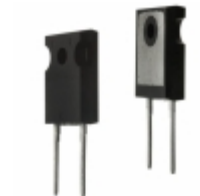
DSEP60-06A IXYS DIODE GEN PURP 600V 60A TO247AD