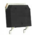
DSEP60-06AT IXYS DIODE GEN PURP 600V 60A TO268AA