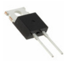
DSEP8-02A IXYS DIODE GEN PURP 200V 8A TO220AC