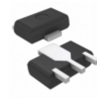
AN77L03M-E1 Panasonic IC REG LDO 3V 0.1A 3HSIP