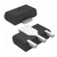
AN77L035M Panasonic IC REG LDO 3.5V 0.1A 3HSIP