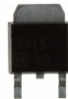
AN7715SP-E1 Panasonic IC REG LDO 15V 1.2A SP3SUA