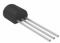
AN77L03 Panasonic IC REG LDO 3V 0.1A TO92-3